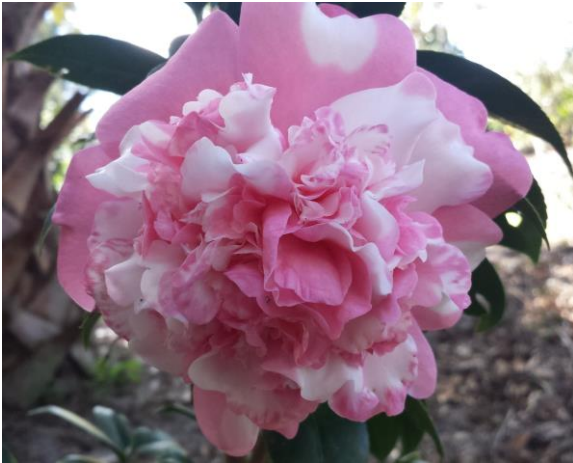
Ladell Brothers Variegated